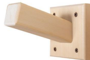
603022 Single Towel Hook (White Cedar)