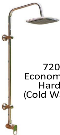
720404 Economy Shower Hardware (Cold Water Only)